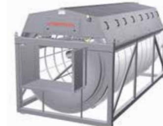
Type 2 frame, Channel inlet (incl. connection for inlet channel)