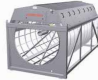
Type 2 frame Open inlet