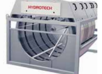
Type 2 frame, Open inlet with half tank