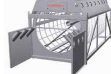
Type 2 frame, Open inlet with Wing walls