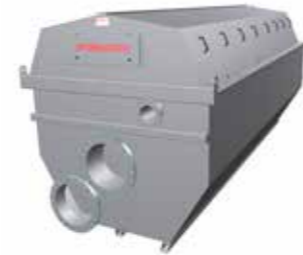
Type 1, Tank (fiberglass or stainless steel)